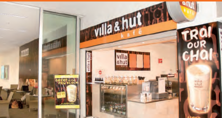
SHOP 15, LEVEL 2 - TELEPHONE 08 8234 4059