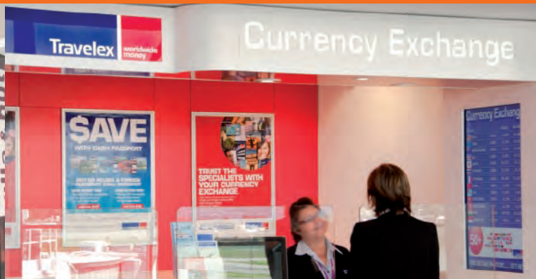
SHOP 16B, LEVEL 2 - TELEPHONE 08 8234 3093