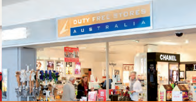
SHOP 16, LEVEL 2 - TELEPHONE 08 8234 3455