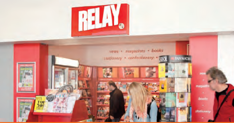
SHOP 16A, LEVEL 2 - TELEPHONE 08 8234 4800